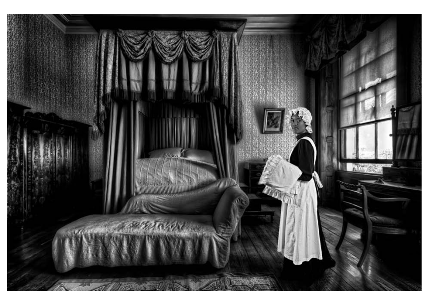
"The Bedroom" by Ian English